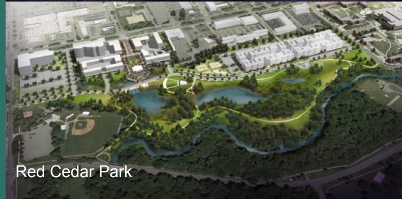
Red Cedar Park