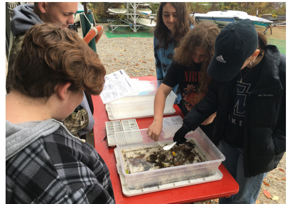
Macroinvertebrate sample identification