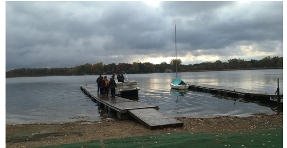
Boat departs for students to collect water samples