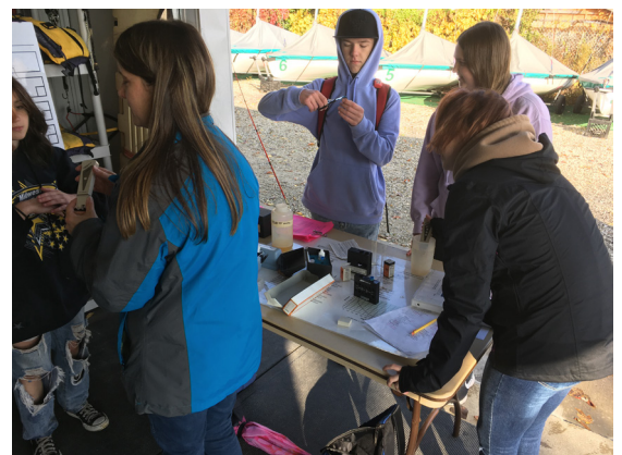
Students perform water chemistry tests