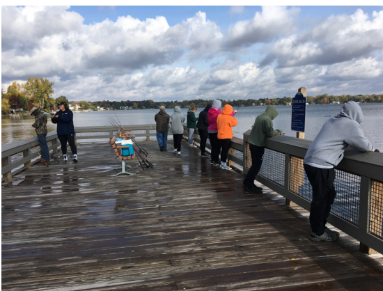
Building resource appreciation through recreation