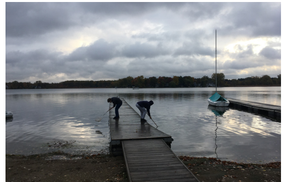
Macroinvertebrate sample collection